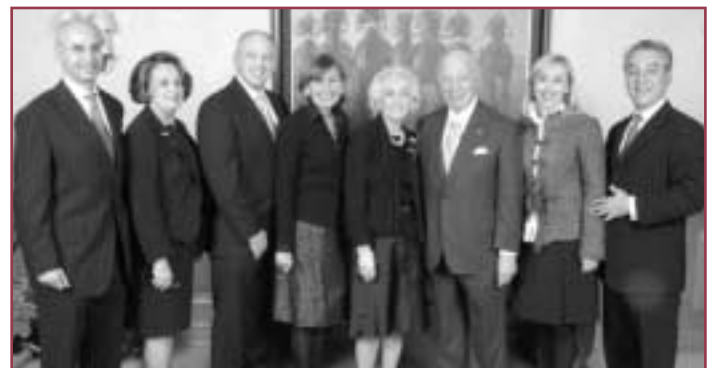
The Cooper Family