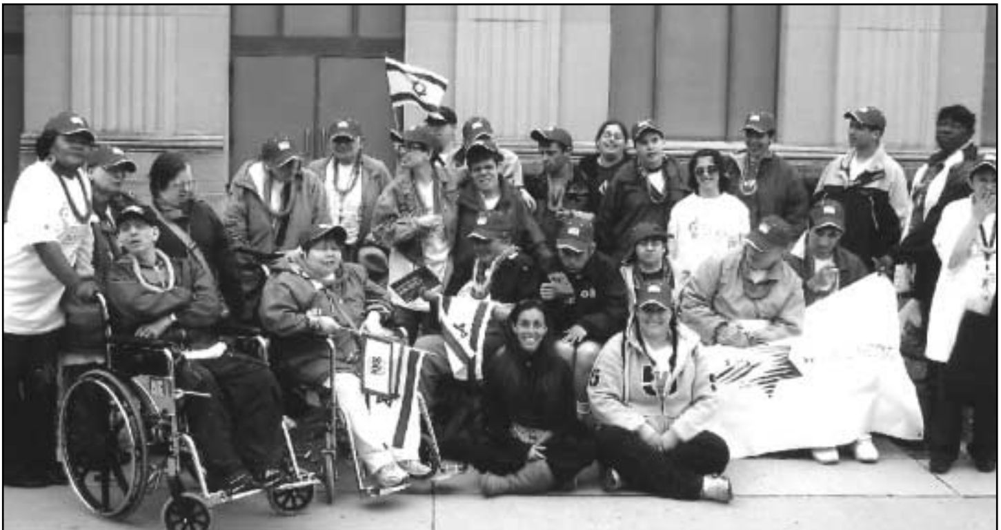
Reena clients walked for Israel Day under the UJA Inclusion banner.

Network and Surrey Place Centre to develop a training tool to help parents plan their family member's future needs and to move towards greater self-reliance. Connections can be accessed on Reena's website: www.reena.org . (see Publications.)