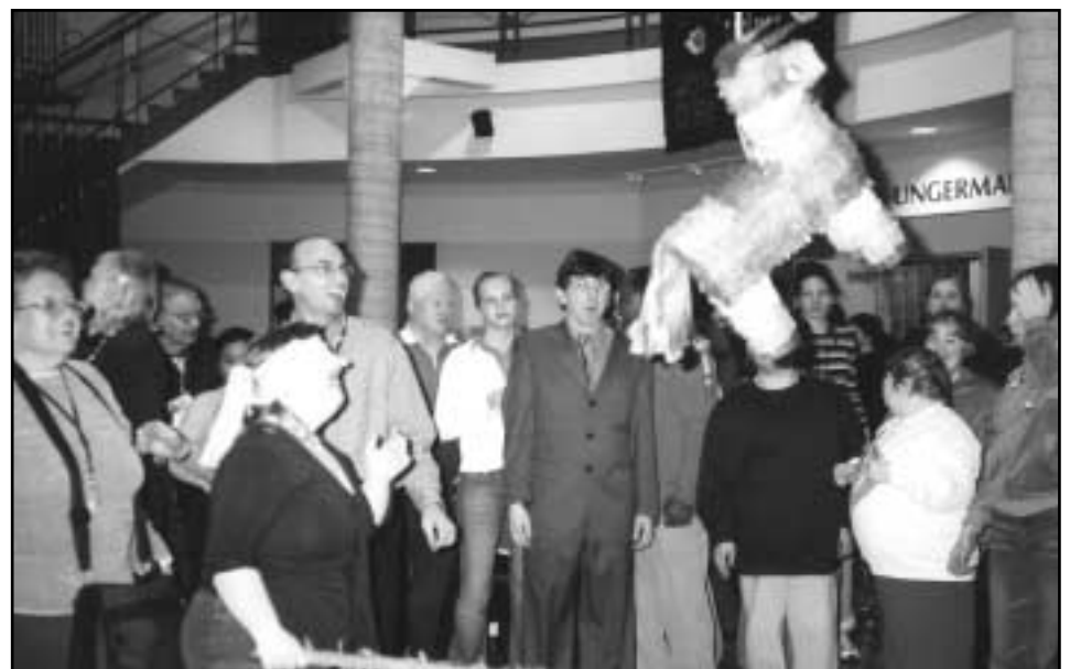
Reena clients love to party!

committees and board of directors - have helped our organization to grow and flourish. In particular I would like to thank all those wonderful teenagers and young adults whose energy and caring have made our Outreach programs so inviting and valuable to the participants. May the coming year be filled with good health, happiness and peace.